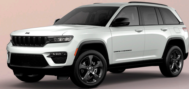
5 seat Night Eagle