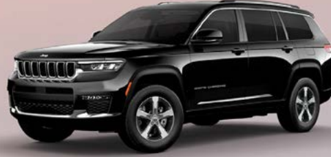
PXJ - Diamond Black (Option)