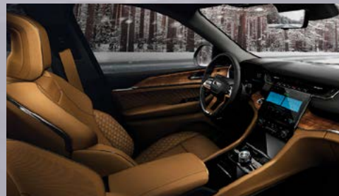
ECT7 - Tupelo Palermo Leather-trim (Option - Summit Reserve Customer order only)