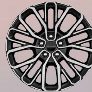
WJE - 21-inch Polished / Painted Alloy Wheels (Standard on Summit Reserve)