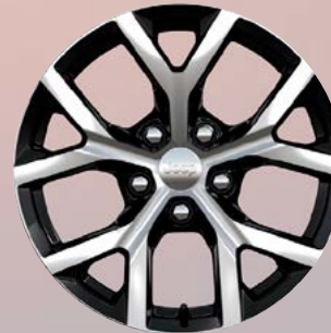
WLH - 18-inch Full Polished / Painted Alloy Wheels (With Off-Road Group (AM2) on Overland)