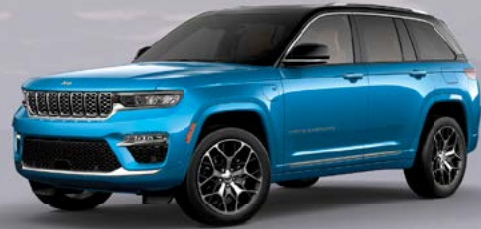
PBJ - Hydro Blue (Option on 5 seat only Customer order only)