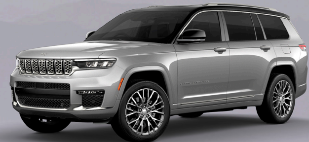
7 seat Summit Reserve