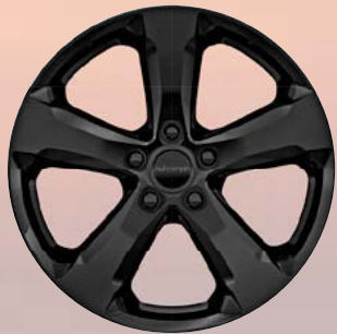
WHF - 20-inch Gloss Black Painted Alloy Wheels (Standard on Night Eagle)