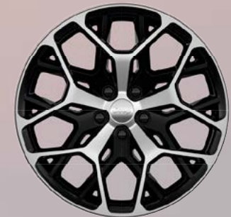
WJA - 21-inch Polished / Painted Alloy Wheels (Standard on Summit Reserve 4xe)