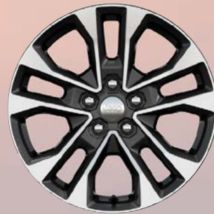
WLJ - 20-inch Full Polished Alloy Wheels (Standard on Overland)