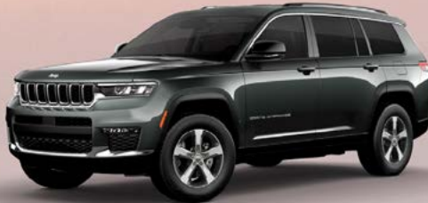
PAS - Baltic Grey (Option)