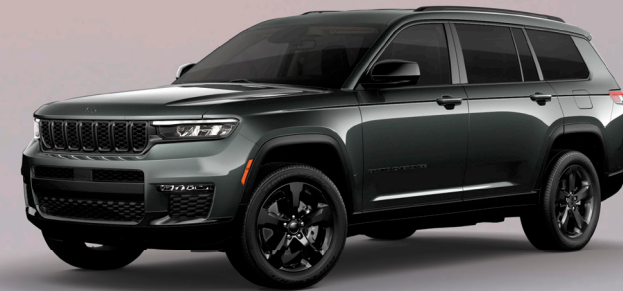
7 seat Night Eagle