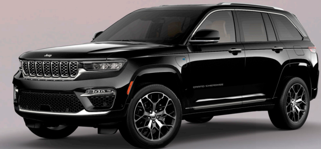
5 seat Summit Reserve 4xe