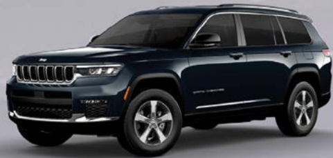
PCQ - Midnight Sky (Option)