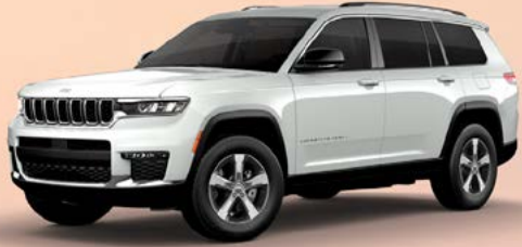
PW7 - Bright White (Standard)