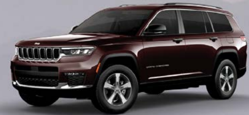
PHC - Ember (Option - 7 seat only)