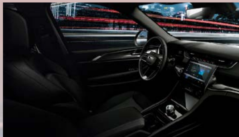
DZX7 - Black Suede & TechnoLeather - accented trim (Standard - Night Eagle)