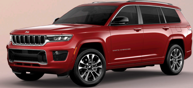
7 seat Overland