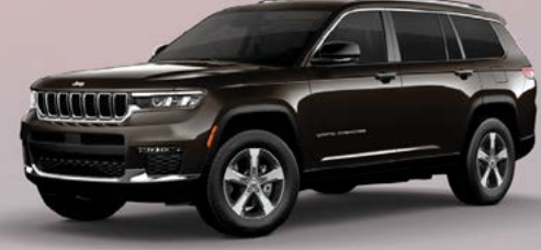
PFJ - Rocky Mountain (Option)