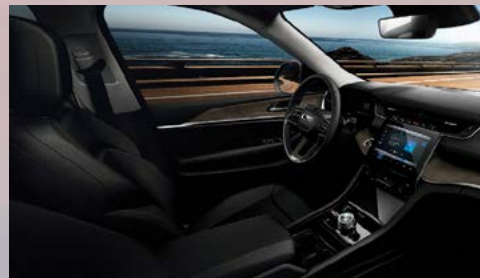
D6X7 - TechnoLeather trim (Standard - Limited)