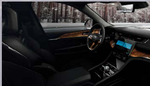
ECX7 - Black Palermo Leather-trim (Standard - Summit Reserve)