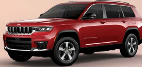
PRV - Velvet Red (Option)