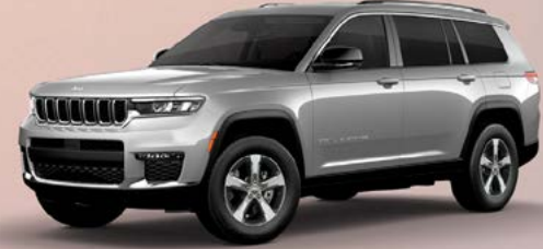
PSE - Silver Zynith (Option)