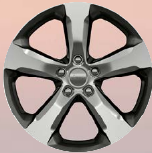
WHG - 20-inch Machined / Painted Alloy Wheels (Standard on Limited)