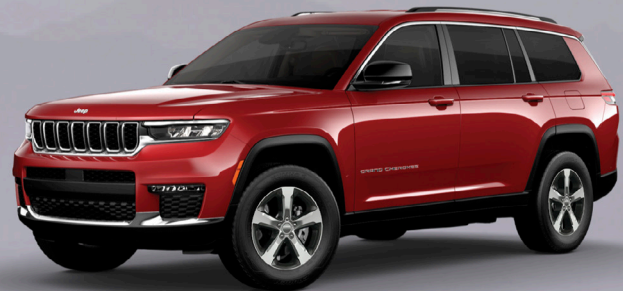
7 seat Limited